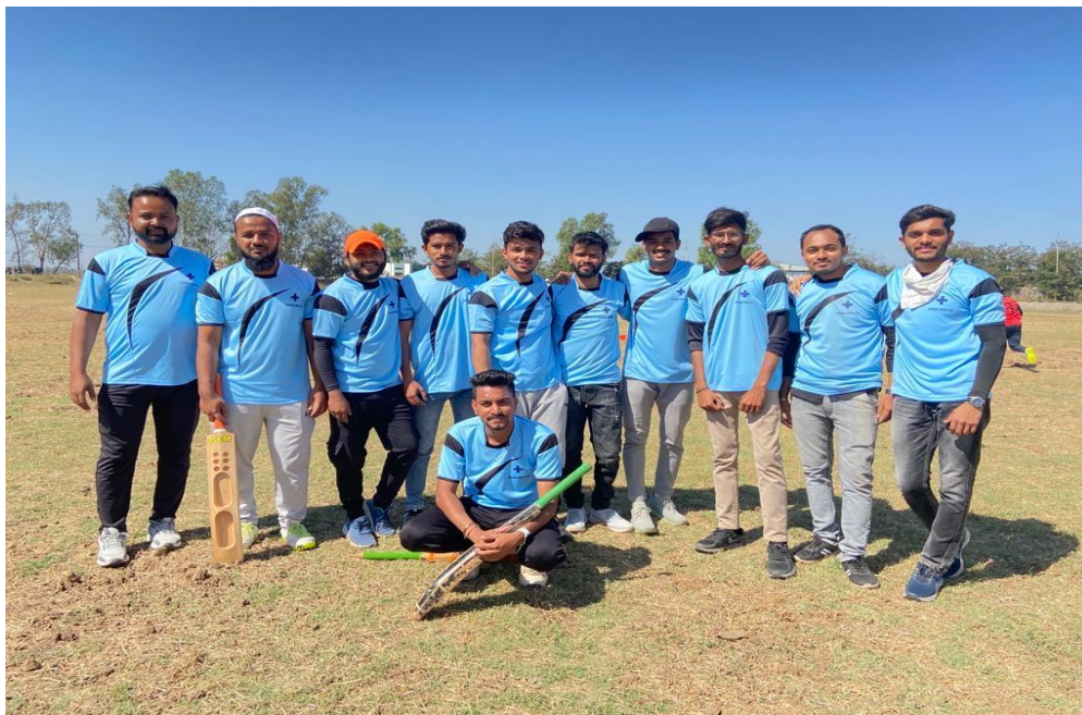
Team Alumni XI (Team of alumni members)