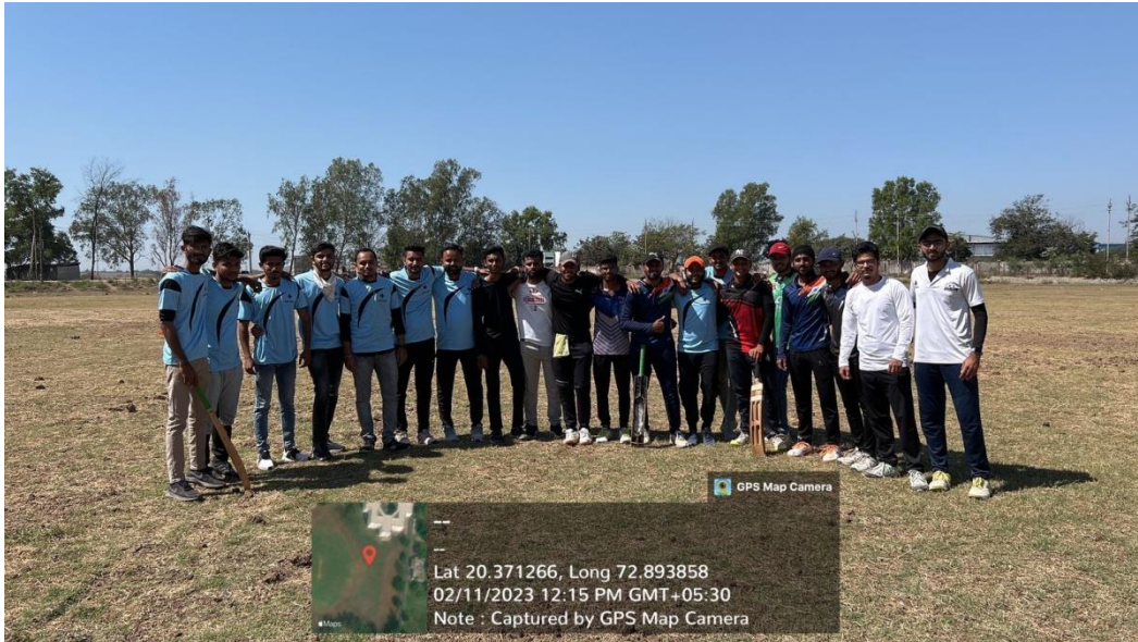
Both team members ready for a cricket match